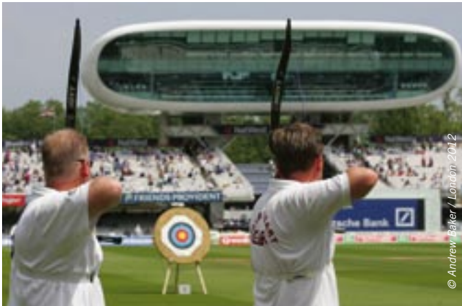
© Andrew Baker / London 2012