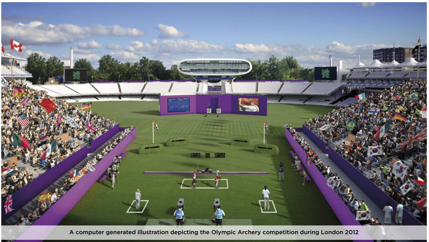
A computer generated illustration depicting the Olympic Archery competition during London 2012

For more information on the Olympics, visit: www.london2012.com