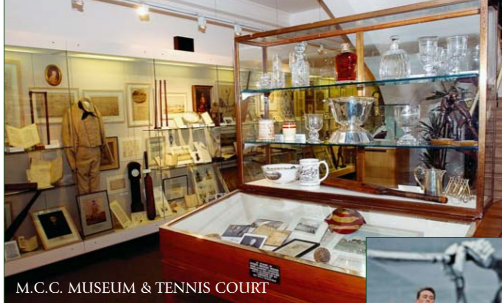
M.C.C. MUSEUM & TENNIS COURT

Once literally a market garden, the Nursery Ground is home to the unique practice ground and Indoor School. It provides a chance for all to play at Lord's.