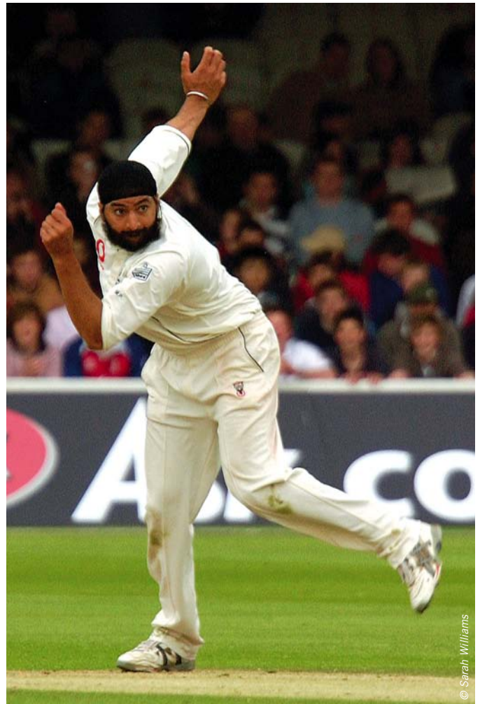
England spinner Monty Panesar bowling at Lord's in 2006