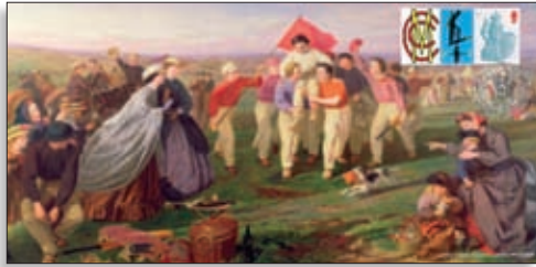
MCC 017, 28th June England v New Zealand (NatWest Series)

For the 2008 season these beautiful and very collectable covers celebrate the role of the spectator in cricket. The theme is based on the new M.C.C. Museum exhibition "Going to the Cricket", and images are from the Club's Collection. Only 500 of these hand-prepared covers and their limited-edition stamps will be issued for each match. Complete matched number sets can also be ordered. These will be despatched when the last one is issued. On 10th July 2008 a unique limited edition of 200 stamp sheets based on the exhibition will also be issued. At £50 per customised stamp sheet plus £3 postage and packing.