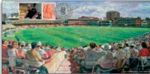
MCC 019, 16th August Friends Provident Trophy - Final