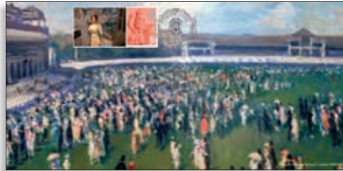
MCC 020, 31st August England v South Africa (NatWest Series)