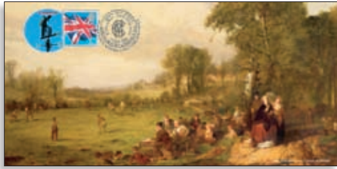
MCC 016, 15th May England v New Zealand (npower Test Match)

For the 2008 season these beautiful and very collectable covers celebrate the role of the spectator in cricket. The theme is based on the new M.C.C. Museum exhibition "Going to the Cricket", and images are from the Club's Collection. Only 500 of these hand-prepared covers and their limited-edition stamps will be issued for each match. Complete matched number sets can also be ordered. These will be despatched when the last one is issued. On 10th July 2008 a unique limited edition of 200 stamp sheets based on the exhibition will also be issued. At £50 per customised stamp sheet plus £3 postage and packing.