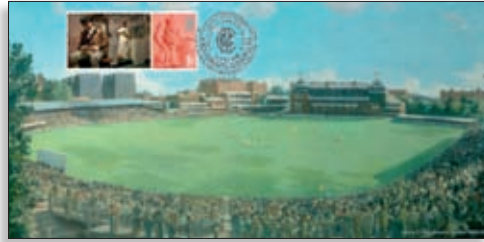
MCC 018, 10th June England v South Africa (npower Test Match)