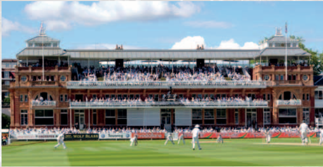
Pavilion – One of the most celebrated buildings in the sporting world, the Pavilion never fails to make an extraordinary impression. Built in 1889 as the clubhouse for MCC, this fine example of Victorian architecture houses the famous Long Room and Players' Dressing Rooms.