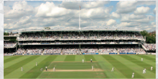
Grand Stand – Opened 1998, the attractive Grand Stand is packed with ardent cricket fans on match days, but also offers impressive views of the Ground throughout the year.