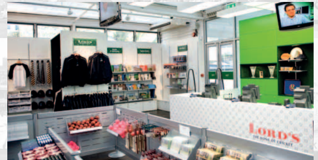
Lord's Shop – Following an extensive refit for the 2009 season the Lord's Shop boasts a wide range of cricket equipment, gifts and souvenirs – helping you to remember your day at the Home of Cricket.