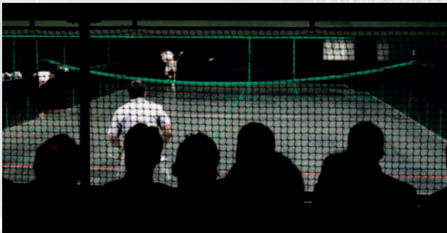
Real Tennis – The real tennis court at Lord's is one of around only 42 in the world; 25 in the UK and of just four in London. This fascinating, complex and intriguing sport was a known favourite of King Henry VIII.