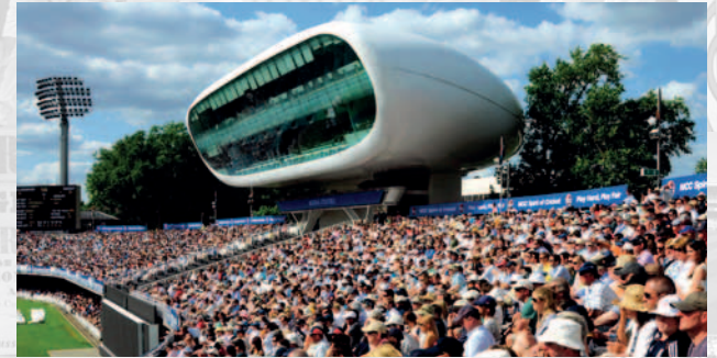
Media Centre – Built to celebrate the new millennium at Lord's, the Media Centre became an instant icon in the world of cricket. The preserve of journalists and commentators on match days with panoramic views of the Ground.