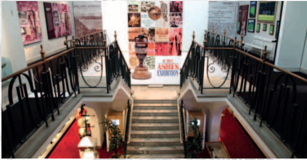
MCC Museum – Housing an unrivalled collection of cricket art and memorabilia, the Museum collection comprises over 30,000 exhibits and is best-known for being home to the Ashes Urn.