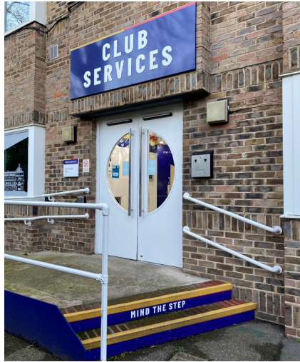
A brick building with white-framed windows and a double-door entrance accessed by two stairs, each with white supporting handrails on either side