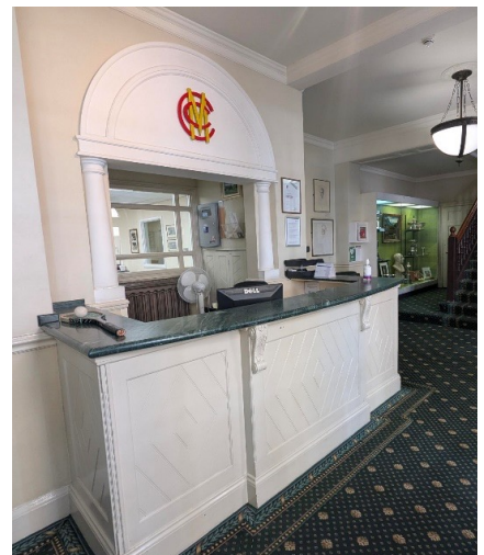
Reception area inside the Pavilion at Lord's Cricket Ground featuring the MCC logo above the desk, a staircase leading upstairs, and displays of cricket memorabilia