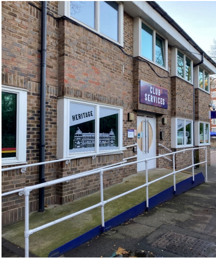
A brick building with white-framed windows features a white handrail attached to a wheelchair-accessible ramp that leads to the entrance, which is opened by an electric button