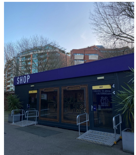
Exterior view of the Lord's Cricket Ground shop, a dark-coloured building with large display windows, an indigo sign labelled "SHOP," and surrounding ramps for accessibility

Both doors typically open to 940 cm but can be widened to a maximum width of 1140mm upon request. The entrance door opens inwards, while the exit door opens outwards, away from the customer. The wooden flooring is level, and the display racks are generally low-level. Some items, particularly clothing, are hung at a higher level for display, but staff are happy to assist. There is a roped queuing system in front of the tills to ensure fairness and ease for everyone when waiting to pay. At 100cm, the counter is low enough to accommodate most wheelchair users. On non-match days, there is no background music; however, cricket commentary may be broadcast from the TVs if they are on. The changing room in the Lord's Shop is fully accessible for wheelchair users.