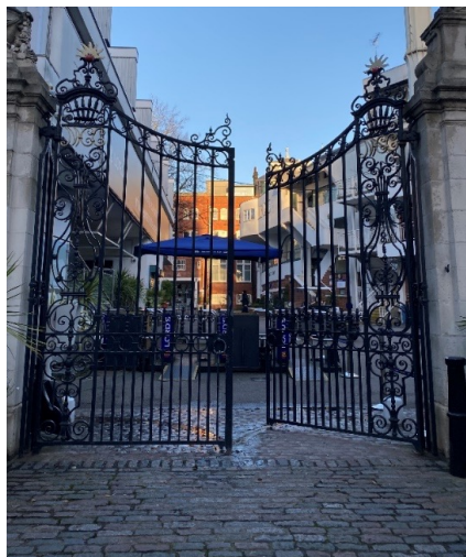
Decorative wrought iron Grace Gates at Lord's Cricket Ground, standing open between two stone pillars and leading into the Ground with a view of buildings and a floodlight beyond

The roadway from the Grace Gate to Reception is even and level, though cobbled edging strips run along the sides. Access to Reception is flat. The main Reception doors have a maximum opening width of 1370mm and do not feature an automated opening system. However, the Pavilion Stewards, located directly opposite the doors during opening hours, are happy to assist as needed. The area inside Reception is flat and carpeted. While the reception desk does not have a separate low counter, its height should accommodate most wheelchair users.