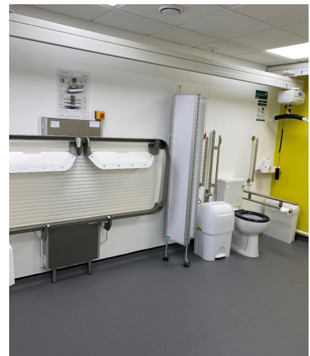
An adult changing places facility with electrical hoist, bench, toilet facilities and privacy screen

There are two Changing Places located on either side of the ground. One is in the Compton Stand at ground level (staircase 6); this facility includes an electric hoist, a changing bench, a shower, and a toilet. The other facility is in the Pavilion Basement and features an electric hoist, a changing bench, a shower, and toilet facilities.