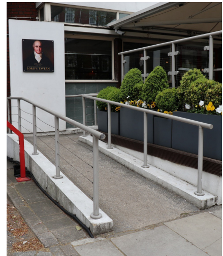
The image depicts the ramp entrance to the Lord's Tavern Pub, featuring metal handrails, a flower planter, and a picture of Thomas Lord, the founder of Lord's Cricket Ground.

The main flooring inside the Lord's Tavern consists of large ceramic tiles. Additionally, there is an upper eating area with wooden flooring (accessible by two steps) and an outdoor wooden decking area. An accessible toilet is available for use, featuring flat-level access from within the main bar.