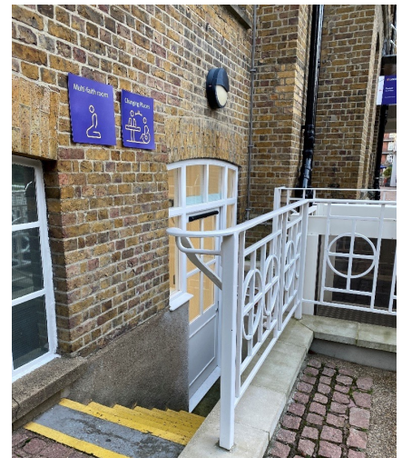
Pavilion building with a white-framed door at basement level, accessed by a short flight of stairs with yellow safety edges; signs above the door indicate a "Multi-Faith room" and "Changing Places" facility

This is located to the right when approaching from the Grace Gate, opposite the Middlesex CCC Office and the MCC Members' Shop. The entrance features a short flight of eight stairs (note that the bottom step is shallower than the others) or an accessible lift (details on dimensions and weight capacity available). Anyone needing assistance with the lift can speak with a Pavilion Steward.