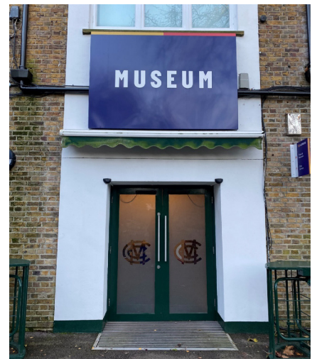
Entrance to a brick Memorial building with a large blue sign reading "MUSEUM" above double doors featuring the MCC logo

Access to the first floor is via stairs comprising 12 steps leading to a large flat landing, followed by an additional 11 steps. The stairs are equipped with flat, metal handrails nearly to the top, stopping just before the landing space. There is no lift access to the first floor.