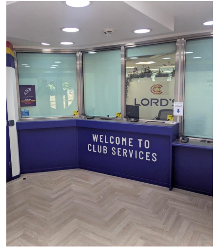
Reception area at Lord's Cricket Ground Club Services featuring an indigo drop counter with "Welcome to Club Services" text, glass service windows, hearing loops, and signage with the MCC logo